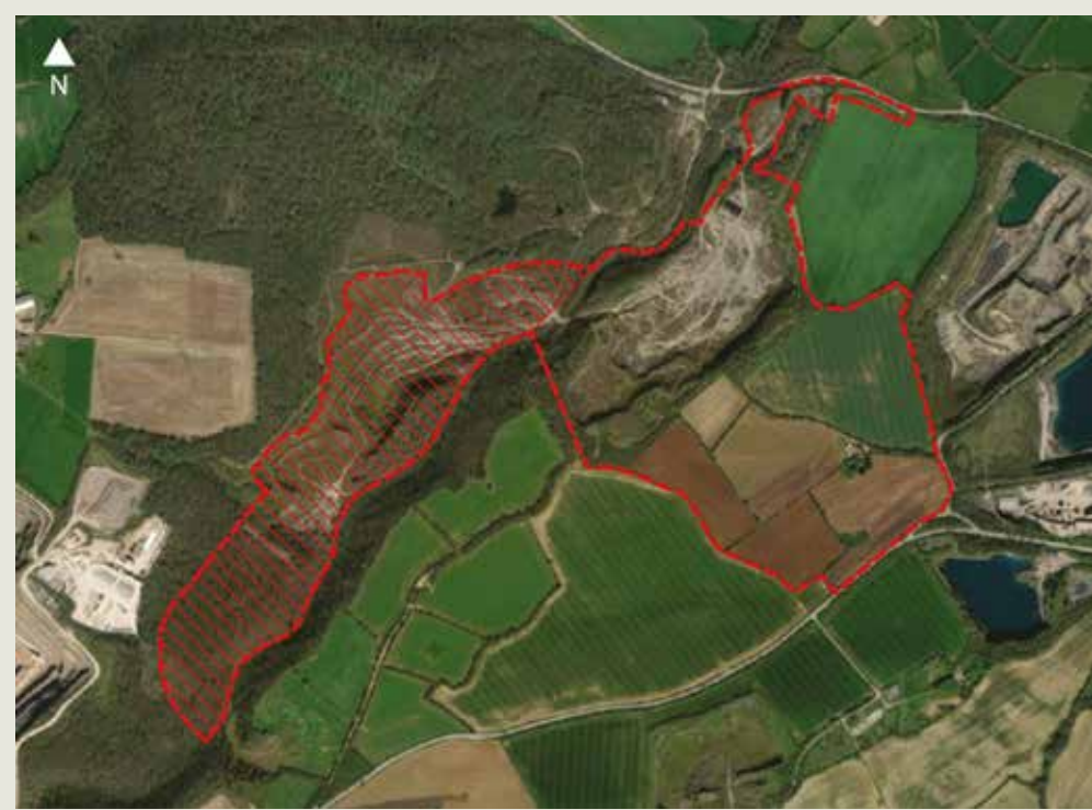
Asham quarry void (hashed area) will be completely outside of the revised scheme boundary