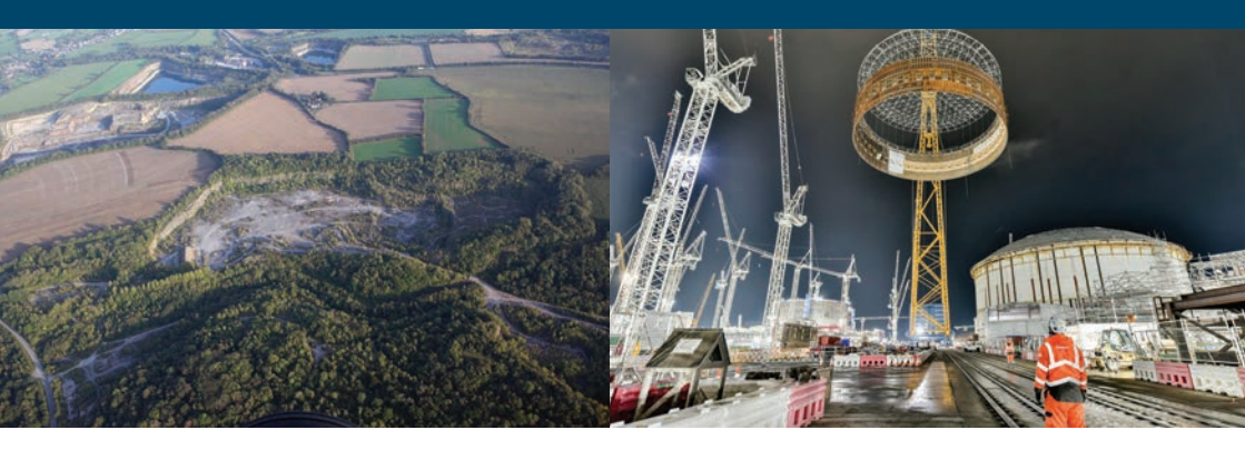
A Reopening Westdown quarry will secure supplies of limestone and serve local demand by road, allowing Whatley quarry to supply national projects by rail